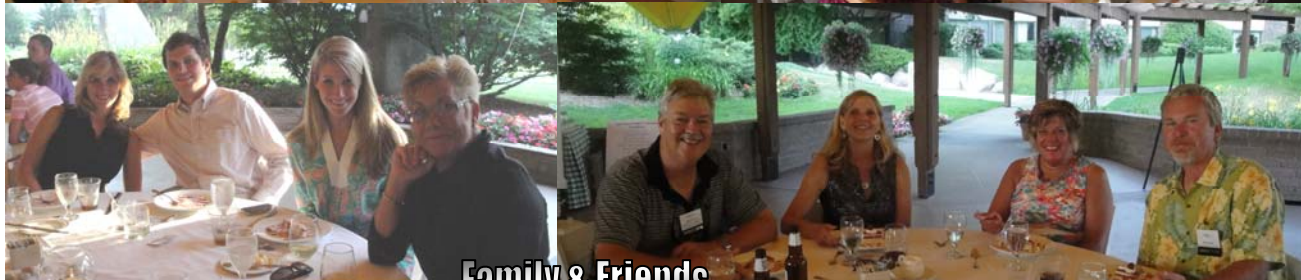
Family & Friends